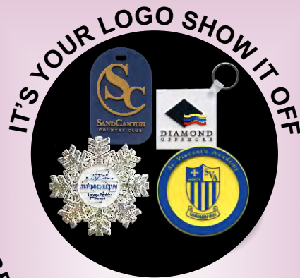
IT'S YOUR LOGO SHOW IT OFF