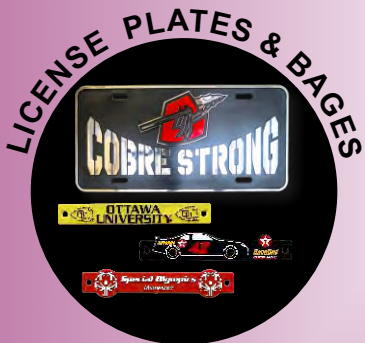
LICENSE PLATES & BAGES