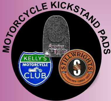
MOTORCYCLE KICKSTAND PADS