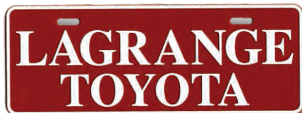
LP2-OC 4-3/8" x 12"