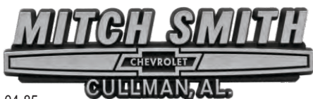
04-85 up to 1-5/8" x 6"