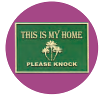
Example: CDiOC-24A is interior green plastic between 17 and 24.9 square inches with strip adhesive.