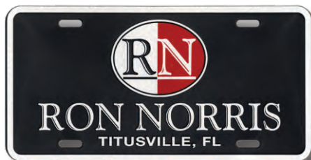
LP1-BKX 6" x 12"